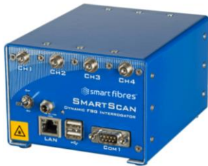
Standard SmartScan and SmartScan Lite models

On clicking the appropriate link, a zip file will be downloaded. After downloading, extract the zip files to a suitable location on a Windows PC. To install the software, run “setup.exe” and follow the instructions that appear during the install process. The installer will place a shortcut in the Windows Start Menu under the Smart Fibres program group and on the Desktop.