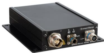
SmartScan Aero Mini